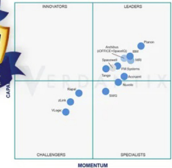
VERDANTIX Green Quadrant Integrated Workplace Management Systems 2022